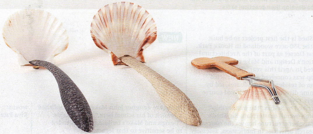
Left Scallop spoons, with trout and salmon-skin handles