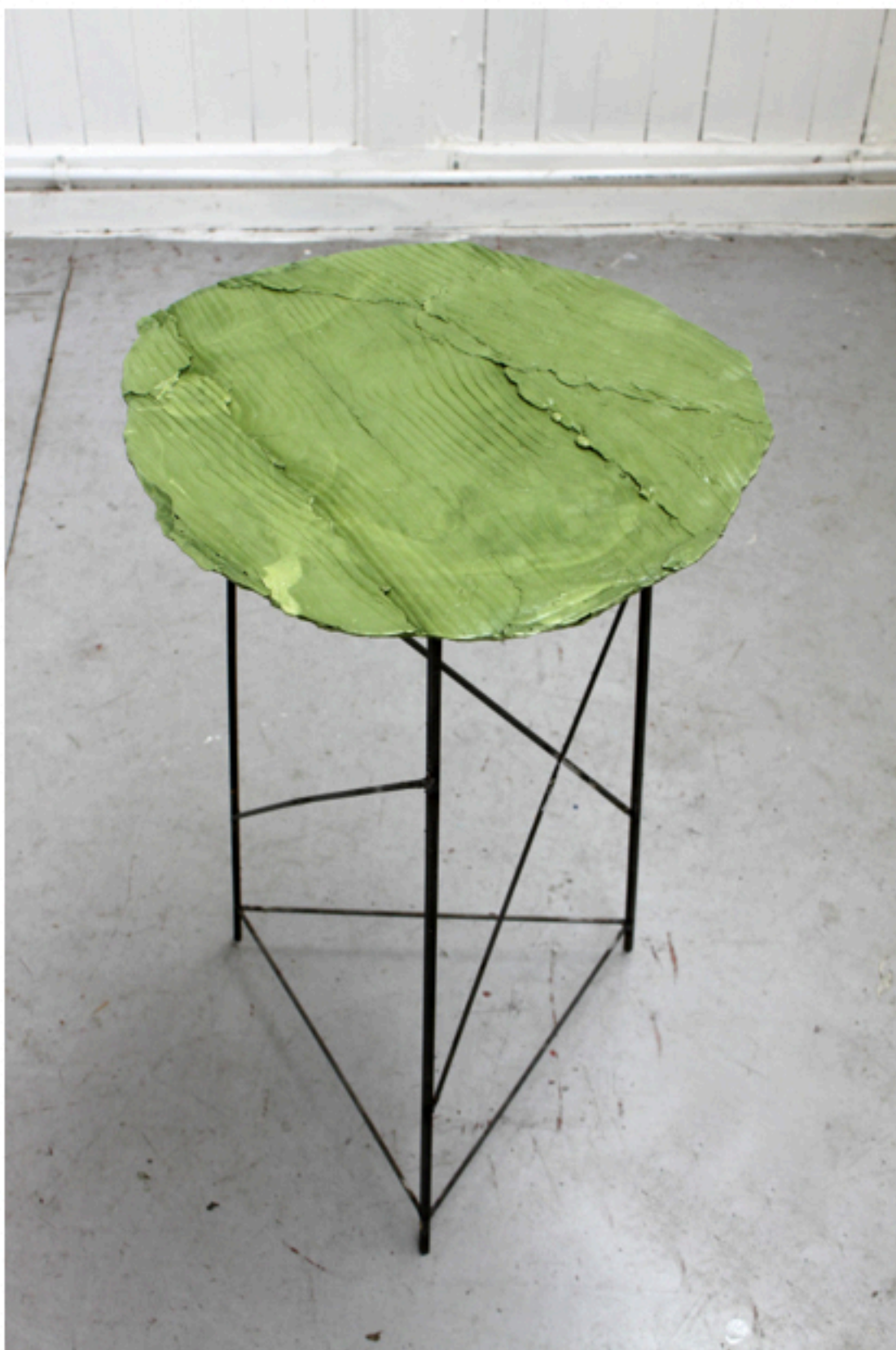
Wooden Table Green 2 by Peter Marigold, 2013.