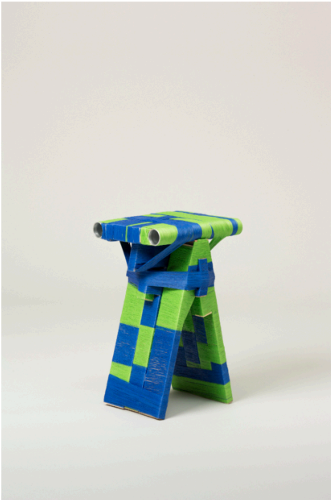
The Thread Wrapping Machine Stool 1 by Anton Alvarez, 2013. Photograph: Paul Plews

Called Drawn From , the exhibition, which is on until 1 March 2014, comprises a number of objects, from boldly idiosyncratic stools from Anton Alvarez's Thread Wrapping Machine series to a series of 24 architecture-inspired lights by Paola Petrobelli, all of which are described by the gallery as possessing a 'linear quality'.