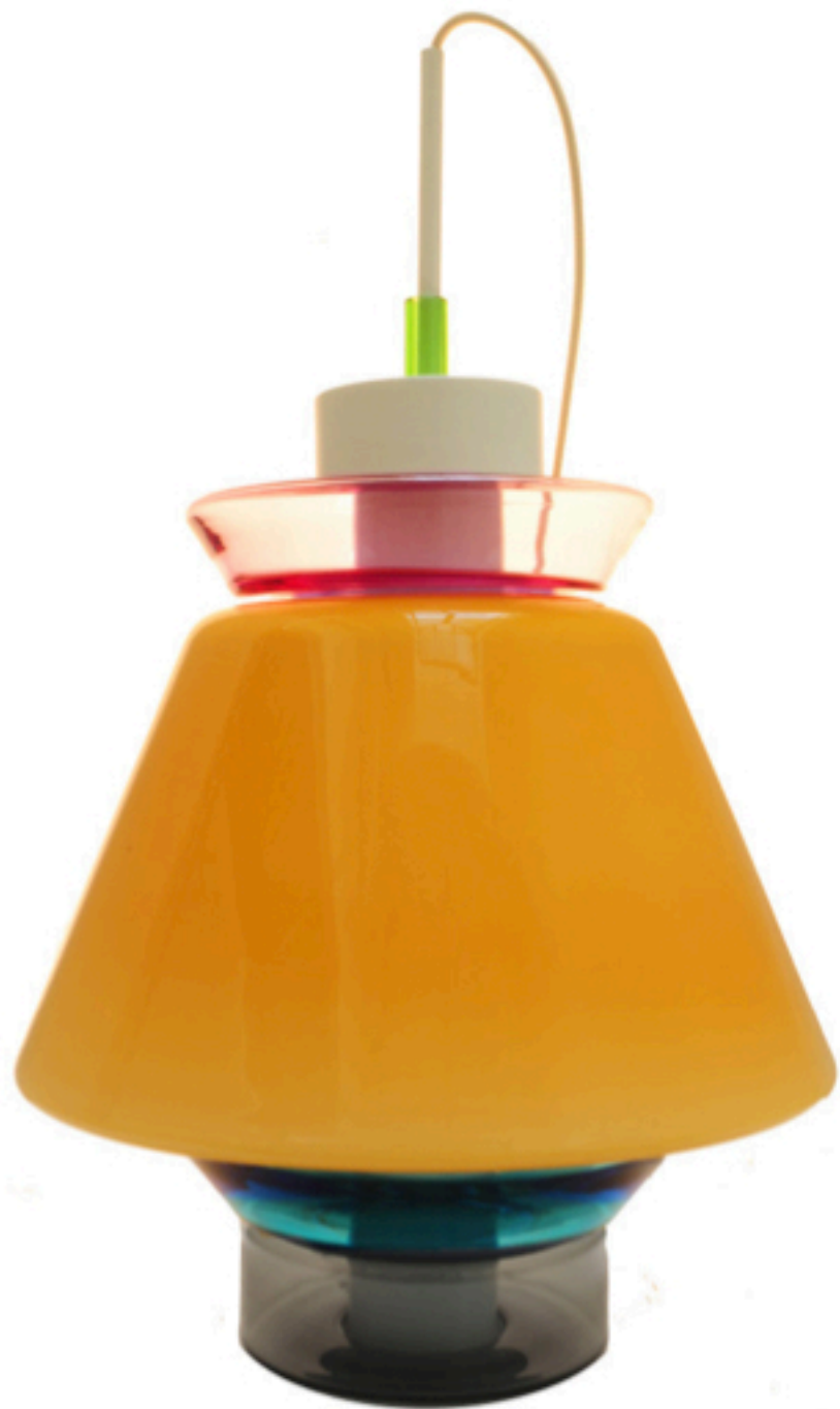
24.2.3 Table Lamp by Paola Petrobelli, 2013. Photography by Paola Petrobelli