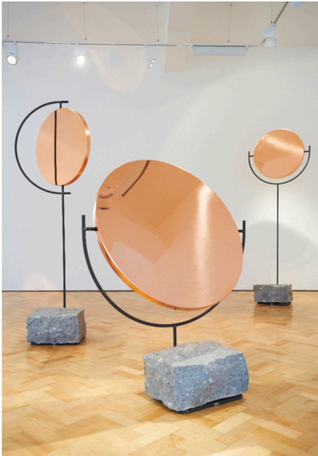
The Copper Mirror Series by Hunting & Narud, 2013.