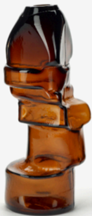
Mould in Motion by ECAL/Philipp Grundhöfer.