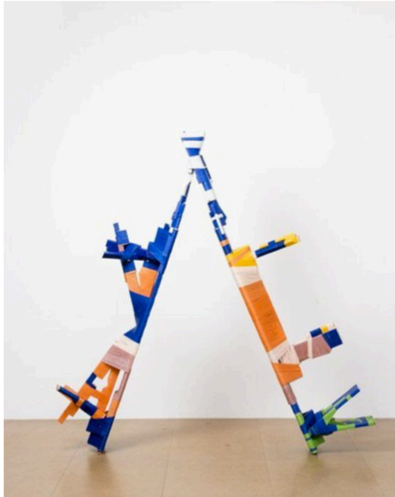
An example of Anton Alvarez's thread-wrapped furniture, on display at Gallery Libby Sellers

'SHAPES ARE IMPORTANT. WITH ANY GOOD DESIGN, YOU CAN IMMEDIATELY RECOGNISE IT FROM THE SHAPE' OLA RUNE FROM CLAESSON KOIVISTO RUNE