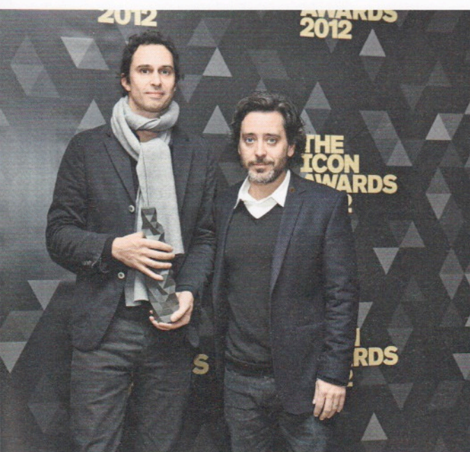
Top left Emerging designers of the year Studio Formafantasma