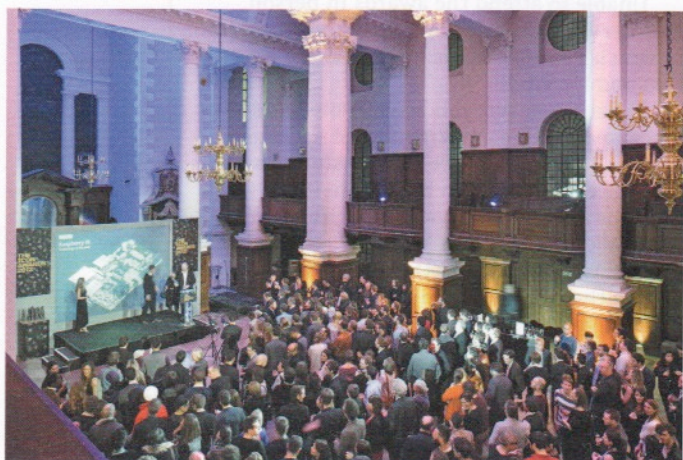
Right Guests gathered for presentation ceremony