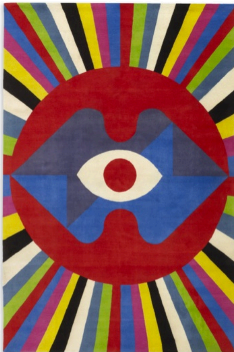
Fumetsu rug M/M Paris.

The portmanteau word “carpetalogue” is the delightful moniker created to describe the ‘pages’ – i.e. carpets – in the current exhibition at Gallery Libby Sellers , London. Celebrating art and design studio M/M (Paris) , the singular exhibition title is interpreted by your scribe as a witty contemporary update of the traditional festschrift – a volume of essays by different writers celebrating a remarkable individual. Instead M/M (Paris) – with a little help from their friends – celebrate themselves. And rightly so. Carpetalogue recognises M/M Paris’ twentieth anniversary and publication of the studio’s monograph .