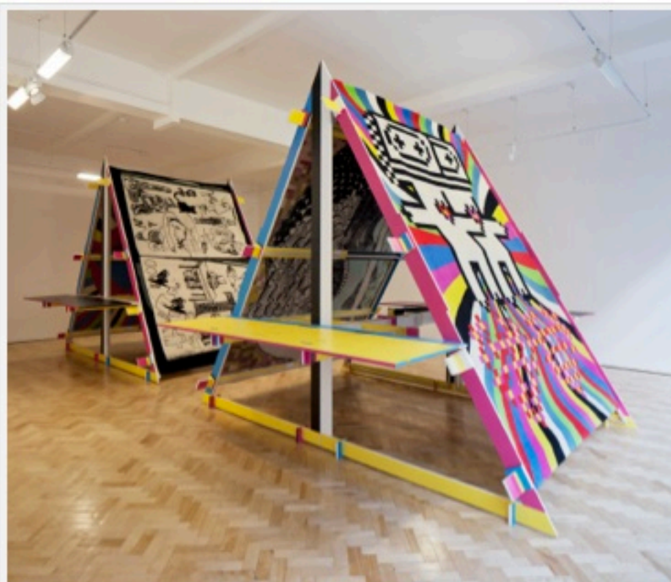
Exhibition installation photograph.