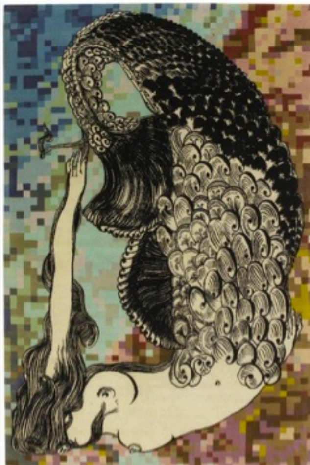
† M/M (Paris), The Carpetologue , rug details

Through 15 December 2012 M/M (Paris): The Carpetologue Gallery Libby Sellers 41-42 Berners Street, London