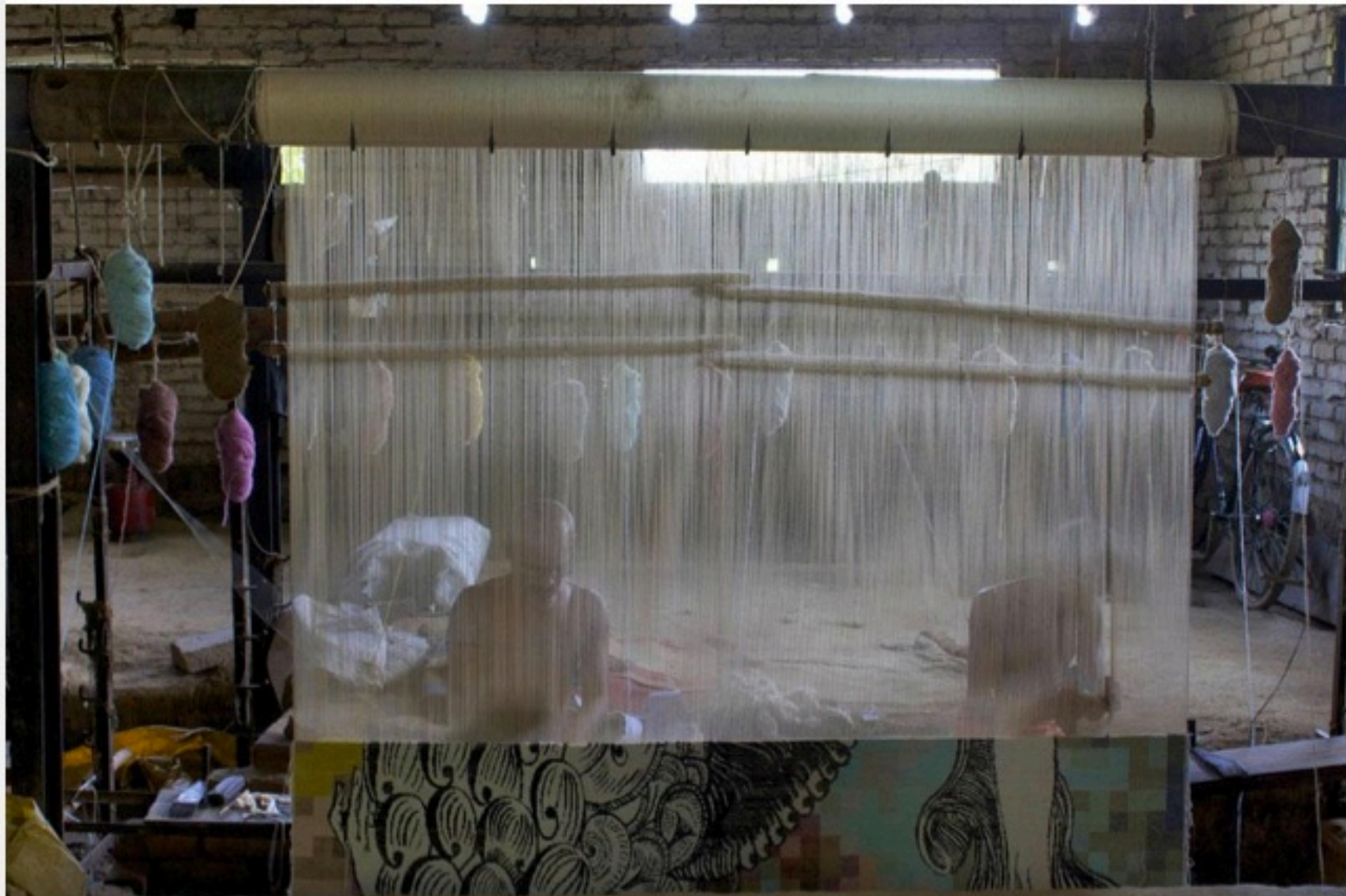
↑ M/M (Paris), The Carpetologue , production

"These rugs by M/M (Paris) combine the ability to create free and imaginary shapes with rigorous geometric compositions, the leitmotif of the studio's work"