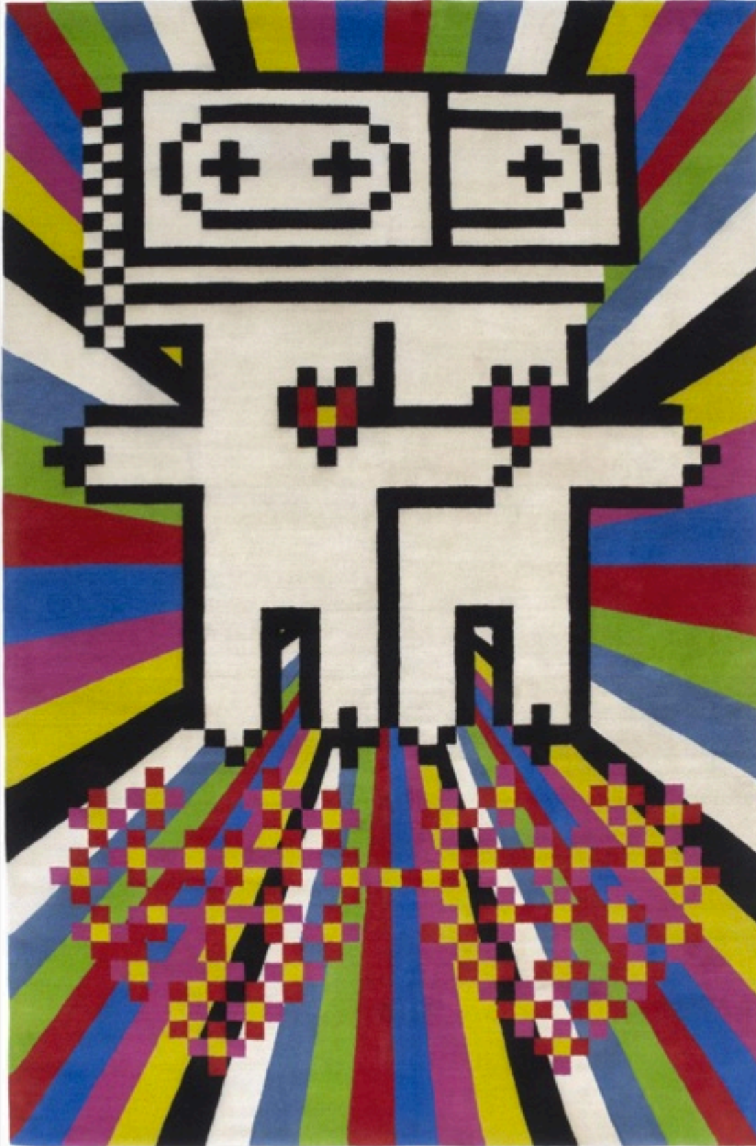
← M/M (Paris), The Carpetalogue , detail of one of the rugs

Another carpet continues the idea of a page/carpet that combines an illustrative design created for Givenchy – an abstract photograph set against a pixelated background – whose contrast highlights the way that M/M combine a strongly digital spirit with another linked to illustrative images in the form of pencil drawings. The third carpet is an exact reproduction of a page of notes, sketches and visual annotations in which the pair appear again with other classic images from the studio's repertoire. The series of carpets concludes with a large eye that symbolises the invincibility of Japan, made as a contribution to Designers for Japan Relief, a fund-raising initiative in response to the 2011 tsunami.