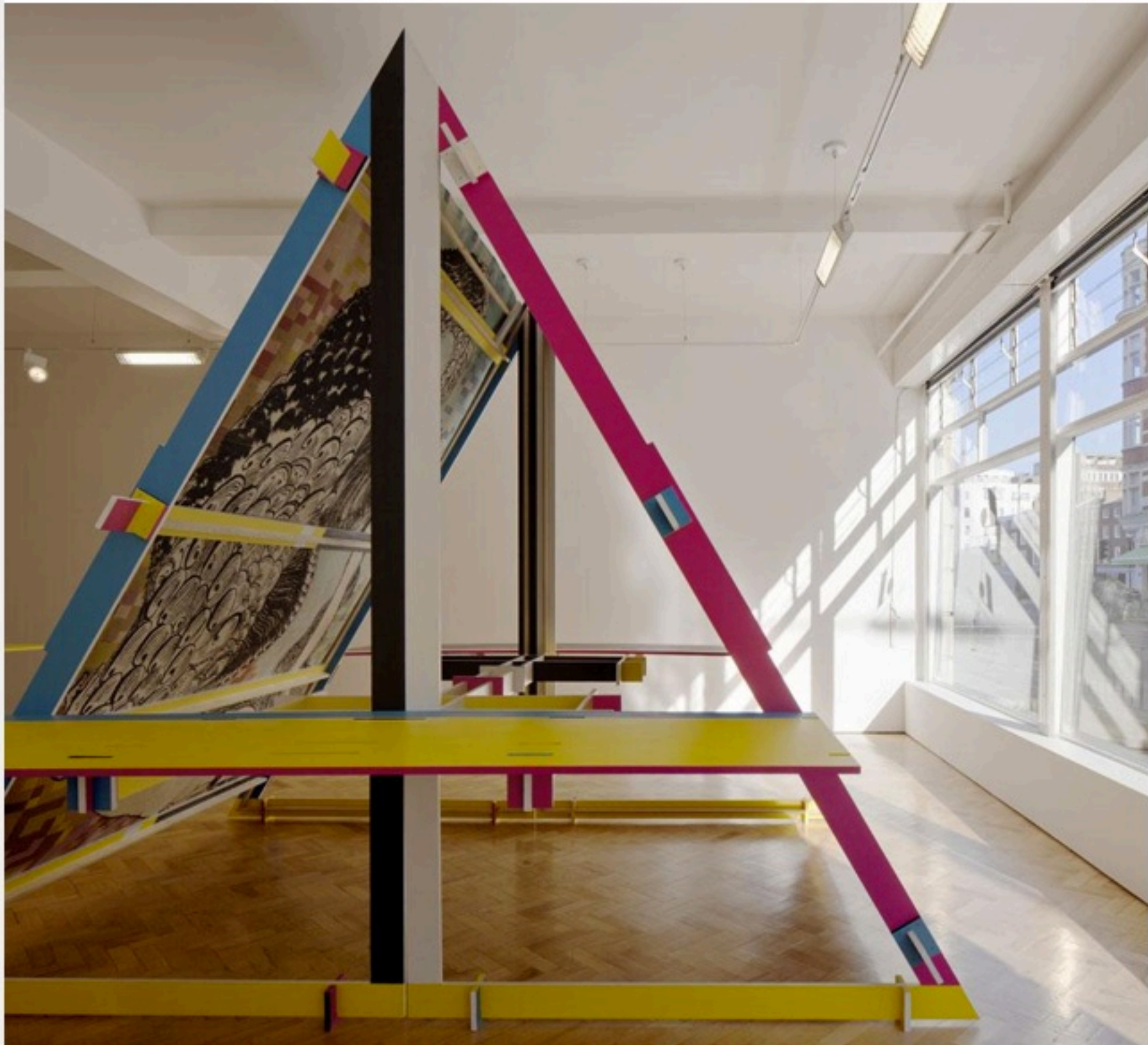
↑ Top and above: M/M (Paris), The Carpetalogue , installation view at the Gallery Libby Sellers, London

Sign up Submit a project Login Like 0 +1 0 Tweet 1 Pin it RSS feed English or Italian or Spanish