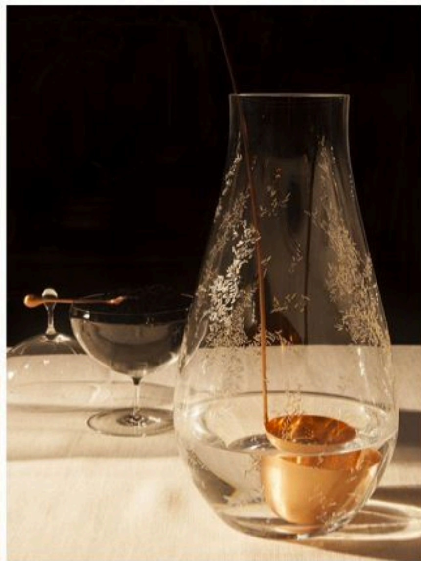
↑ Formafantasma, Still

The skilled craftsmanship of the pieces and the proportions of the copper filters invite the user to handle them with care, transforming these everyday gestures into a ritual of water purification. The crystal has been engraved with two different motifs: the first is the reproduction of a microscopic bacteria that lives in rivers, the other is the representation of organisms that live in the oceans and have a skeleton made from silicon, the principal component of glass.