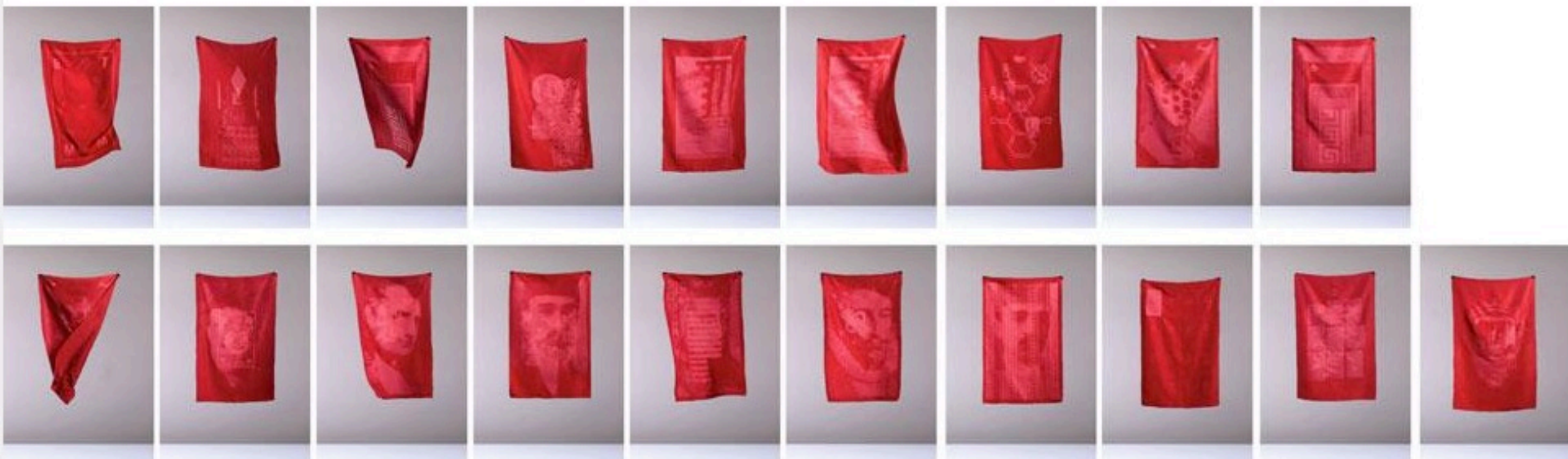
↑ Studio Formafantasma, BTMM1514 (Turkish Red) , collection of 17 silk textiles