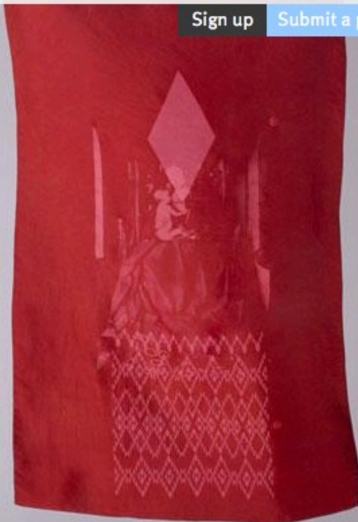
↑ Studio Formafantasma, BTMM1514 (Turkish Red) , collection of 17 silk textiles